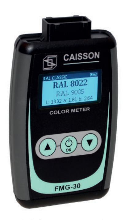
Figure 1. Color meter, general view

Color meter enables measurement of the color intensity difference between a sample under examination and a specimen. Based on a selected color palette, the device's feedback information shows two colors most closely related to the sample under examination and CIELab color space values L*a*b or the percentage of the components of the sRGB color space. The instrument's vertical construction enables measurement of very small areas.