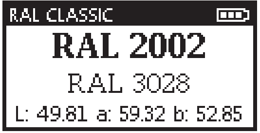
Figure 8. Lab values