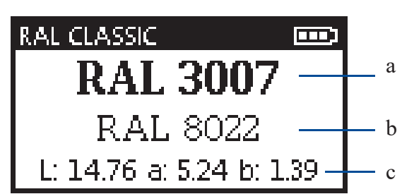
Figure 5. Display with a measurements result