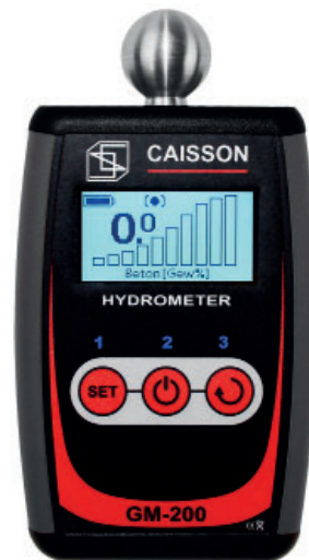
GM-200 in menu modes.

The operating menu allows for changing alarm thresholds for the respective measurement scales and selecting at language. To access the operating menu, press and hold down the “SELECT MATERIAL” and “SELECT DISPLAY” buttons. Use the “SELECT MATERIAL” and “SELECT DISPLAY” buttons to navigate the menu. Use the “ON” switch to change menu levels and to confirm the settings. CAUTION! Critical parameters are protected against unintended modification with the use of an additional warning and request for confirmation. To navigate to the parent menu, press “Back” and briefly press the “ON” button. To exit to the main window, confirm the “Back” option of the top level menu.